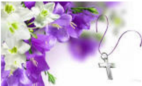
Sheila remembrance day